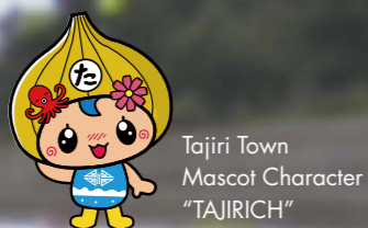
Tajiri Town Mascot Character "TAJIRICH"

Marble Beach and Seaside Green Area White marble is spread over the beach, and a green pine forest continues behind it. The sunset scenery provides the perfect spot that commands the sight of the Kansai International Airport. It takes 15 minutes on foot from Yoshiminosato Station on the Nankai Main Line. Alternatively, it takes 15 minutes by foot from Rinku Town Station on the Nankai Airport Line or the JR Kansai Airport Line.